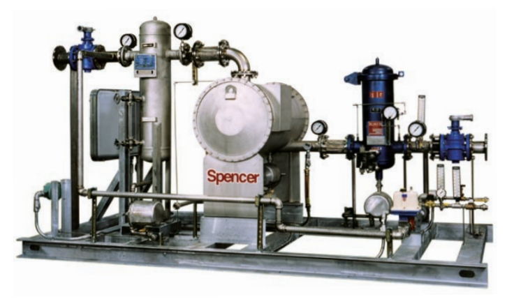
Spencer booster system installed at a California WWT plant includes a filter separator, heat exchanger and moisture separator for delivery of digester gas from maximum design volume down to "0" scfm.

Spencer digester gas booster skid package using anaerobic digester gas (ADG) at a fuel cell application in Hunts Point NYC funded by New York Power Authority.