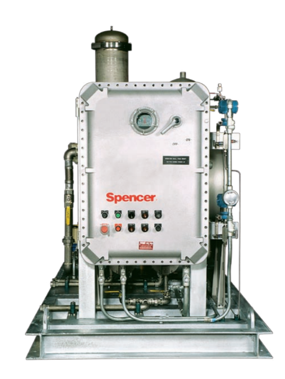
Control Panel featuring NEMA 7 enclosure controls the supply of bio-gas used as boiler fuel at a West Coast facility. It includes alarm and fault protection for high temperature and both low and high gas pressure.

For product selection assistance, please email marketing@spencer-air.com or visit our website at www.spencerturbine.com to locate the Spencer representative in your area.